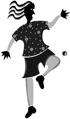
Team in Training raises money for the Leukemia and Lymphoma society in many different ways.