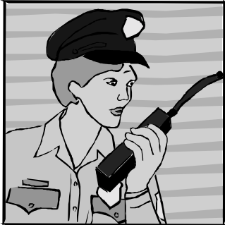
The new "HotSpots" system will allow police officers to wirelessly transfer data from their cars to the station.